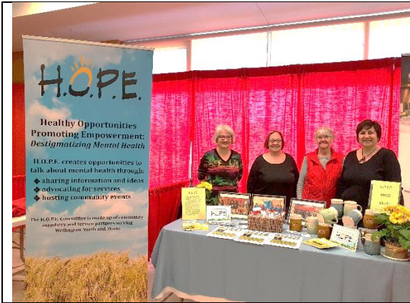
Hope Committee Participating in Showcase Wellington North