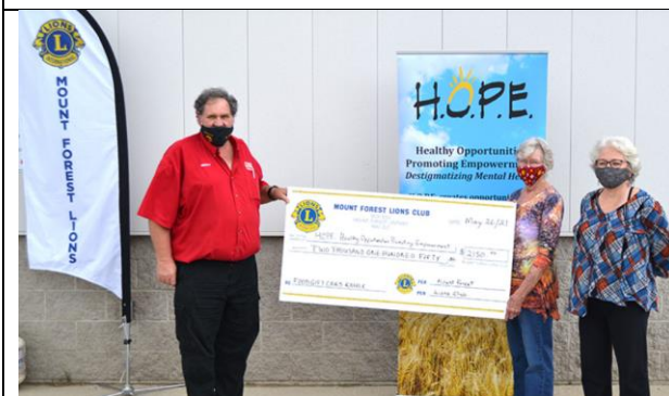
2021-Mount Forest Lions donated $2150 to the work of the HOPE Committee